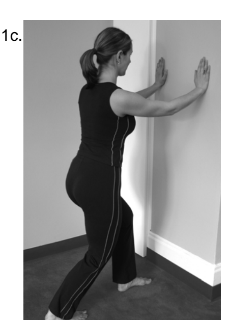
Standing Calf Stretch x2

1a & b. Begin in staggered stance with hands on the wall. Keep back knee straight and heel on the floor. Slowly bend front knee and lean toward wall until stretch is felt in back calf. Hold 30 seconds. Repeat on other side.